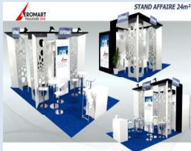
This picture is subject to modifications

This package is a partnership that guarantees your company a high profiled participation. No competitors of yours will be granted this option.