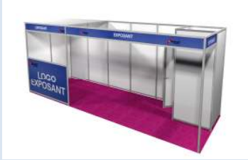
This picture is subject to modifications

1300 companies 2500 participants 15000 BtoB meetings 45 countries represented