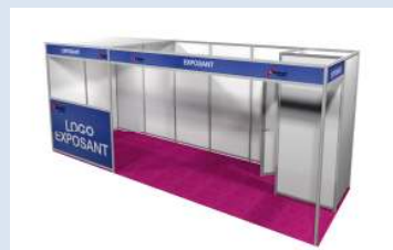
This picture is subject to modifications